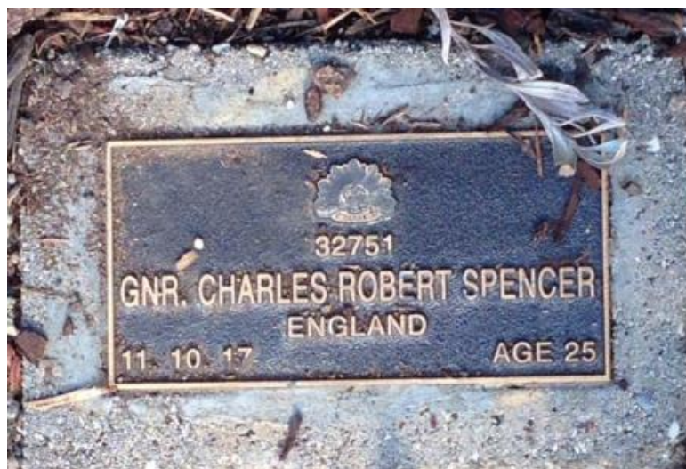
Memorial Plaques