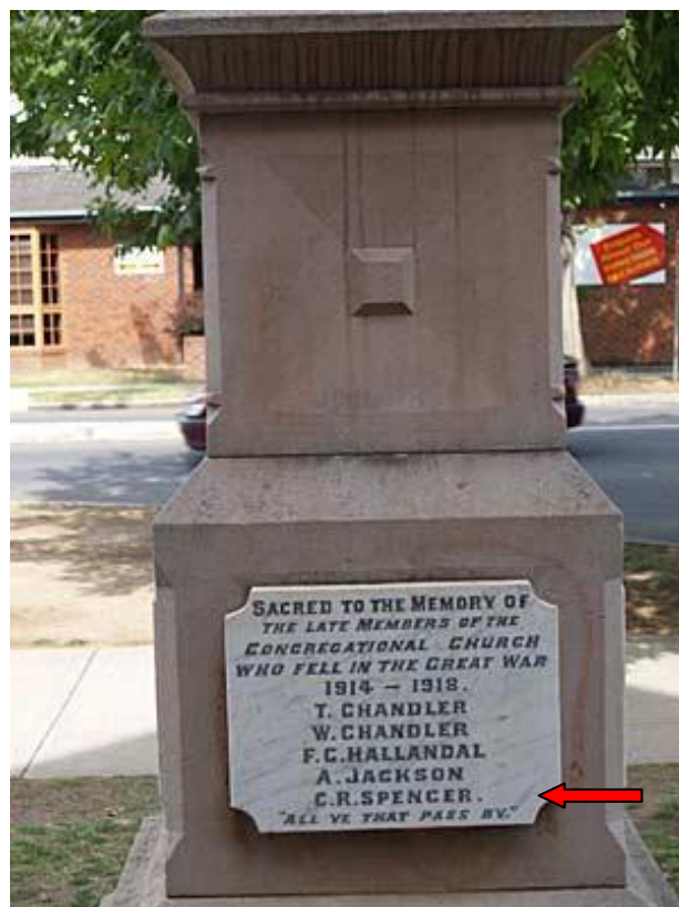
St. David's Uniting (Presbyterian) Church War Memorial, Albury