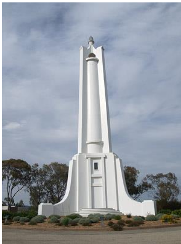
Albury War Memorial